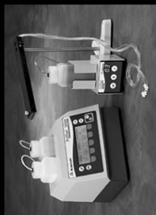
PriMet® 3000 Modular Dispensing System