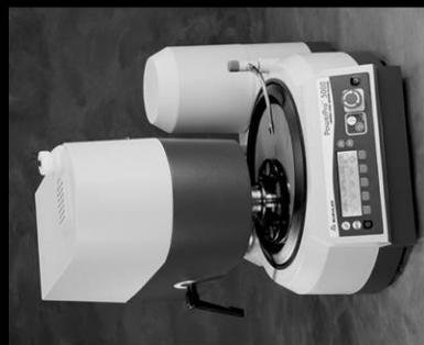
PowerPro™ 5000 Variable Speed Grinder-Polisher

9650 Jeronimo Road • Irvine, California 92618 • USA